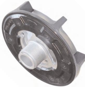
CH-108 Direct Drive Clutch High Thread Post Limiter Hub For CA-172 & CA-176