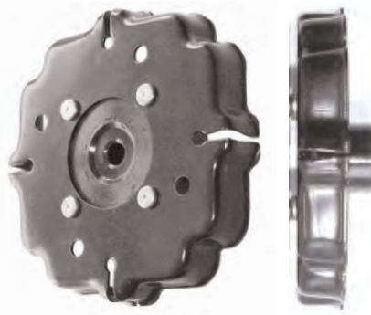
CH-105 Direct Drive Clutch Limiter Hub For Plastic Pulleys Only

Call Your Sunair Sales Rep Now To Order!