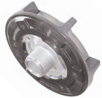
CH-109 Direct Drive Clutch Low Thread Post Limiter Hub For CA-173