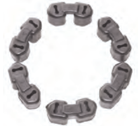
MC-1082 Rubber Bumpers For Plastic Pulleys Only