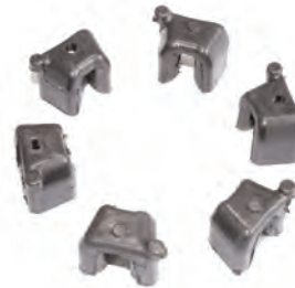
MC-1080 Rubber Bumpers For CA-174 Only

NOTE: Rubber Boots & Bumpers are NOT INTER- CHANGE- ABLE!