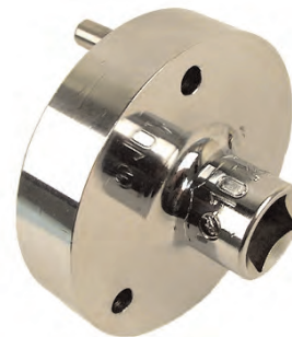
TL6130 5SER09C Denso Clutch Hub Installer / Remover Tool

Call Your Sunair Sales Rep Now To Order!