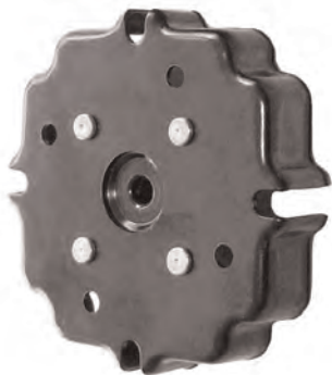
CH-103 High Metal Hub for CA-166, CA-179, etc.