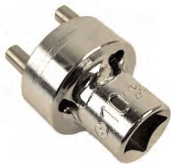
TL6129 7SEU Denso Clutch Hub Installer / Remover Tool