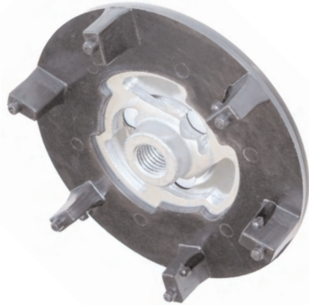
CH-107 Direct Drive Clutch Limiter Hub For CA-174